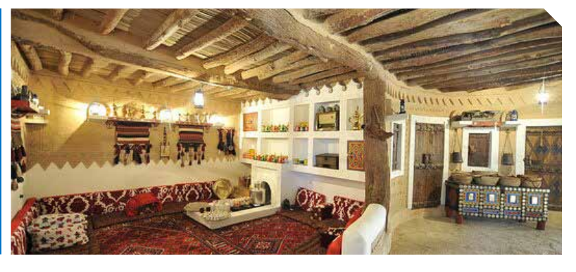
Najd Village Restaurant Discover the traditional authentic Najdi-Saudi flavors.